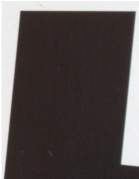
Nikkor-S 5.8 cm f/1.4